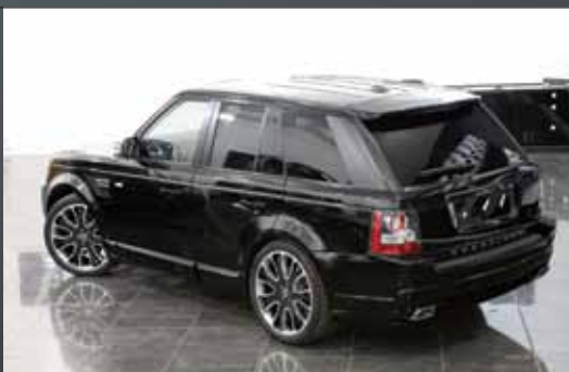
OVERFINCH RANGE ROVER SPORT