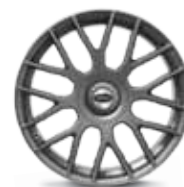
MATT GRAPHITE / GT CAP