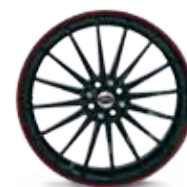
GLOSS BLACK / RED LINE