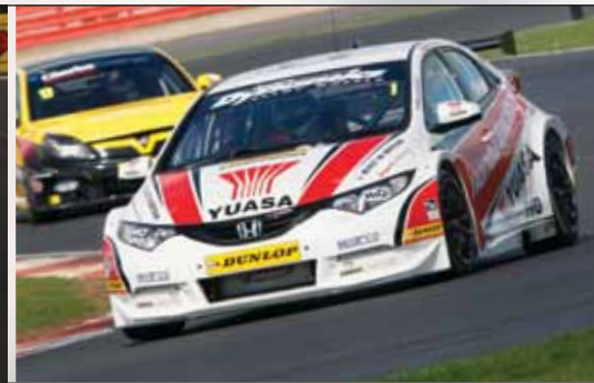
BRITISH TOURING CAR