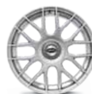
HI-POWER SILVER / GT CAP