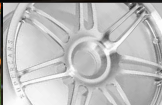
V8 SUPERCARS WHEEL

Aluminium forged and billet machined wheels are now a very popular engineering favourite for combining weight optimisation, strength and durability. The Team Dynamics Pro Forged range can be produced for complete Championships like Australian V8 Supercars looking for ultimate performance in a cost effective manner to GT and Sports Prototype racing where performance is sort like the holy grail.