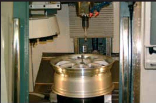
DIGITAL MACHINE SHOP