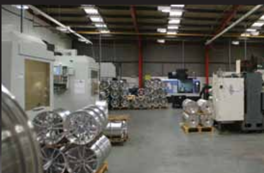
HI TECH FORGED UNIT