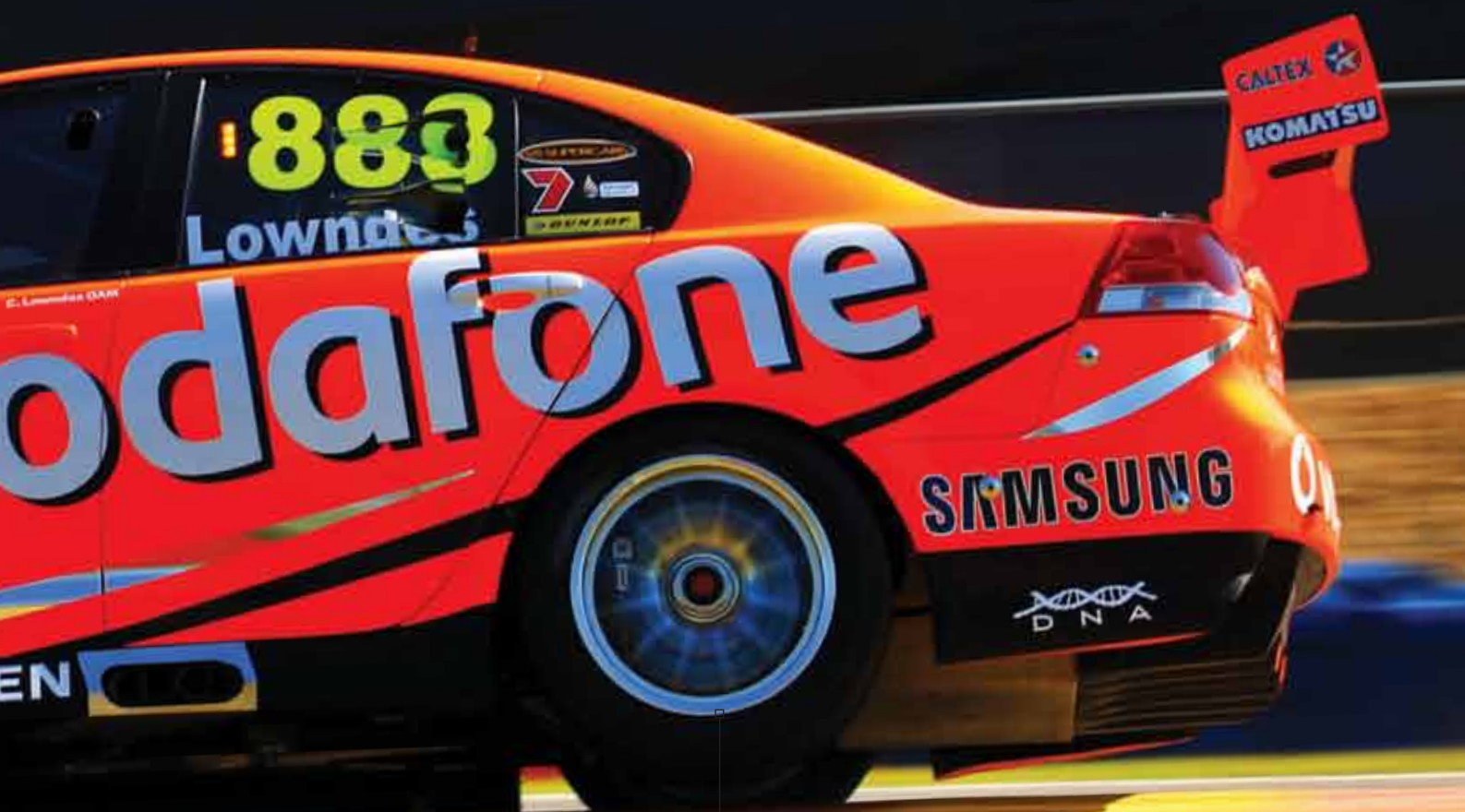
Team Vodafone V8 Supercar fitted with Team Dynamics 17 x 11 forged aluminum race wheels

Available 16 through to 21 inches in a comprehensive range of rim widths and offsets.