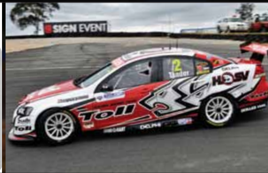
V8 SUPERCARS: TOLL HOLDEN RACING TEAM