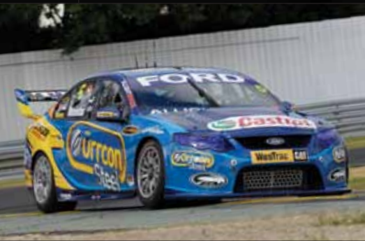
V8 SUPERCARS: FORD FALCON FG