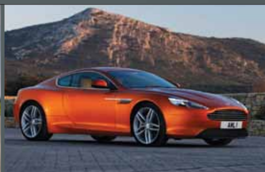
ASTON MARTIN VANTAGE