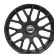
MATT BLACK / GT CAP