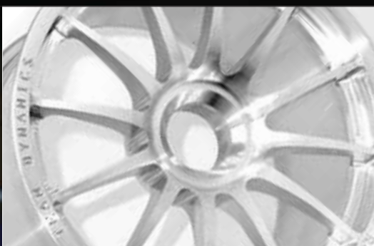
V8 SUPERCARS WHEEL