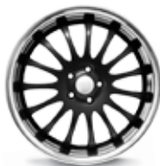
BLACK / STAINLESS STEEL RIM