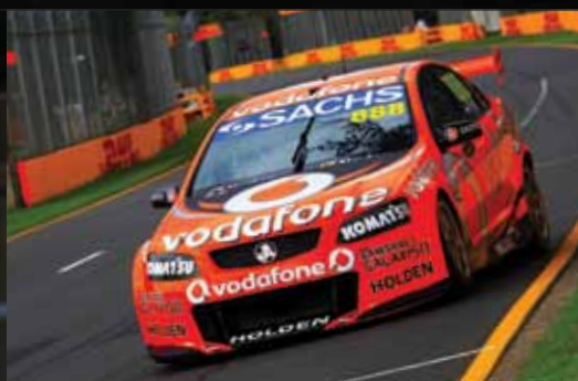
V8 SUPERCARS: TEAM VODAFONE