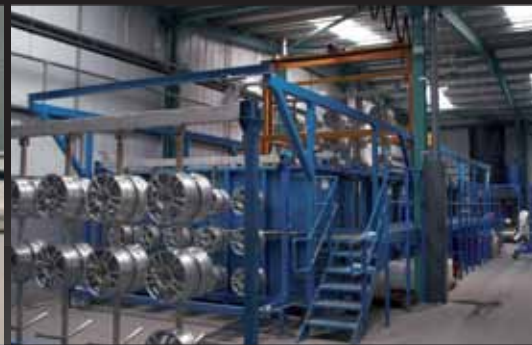
11 STAGE PRE TREATMENT