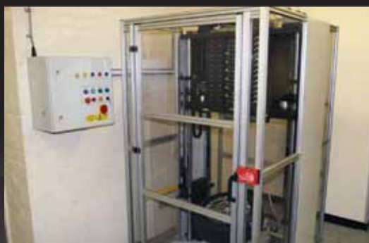
WHEEL TEST FACILITY