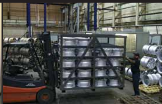
IN HOUSE HEAT TREATMENT

Rimstock is a premier manufacturer of race and specialist aluminium wheels, boasting the largest and most advanced manufacturing facilities of any wheel producer in the UK.