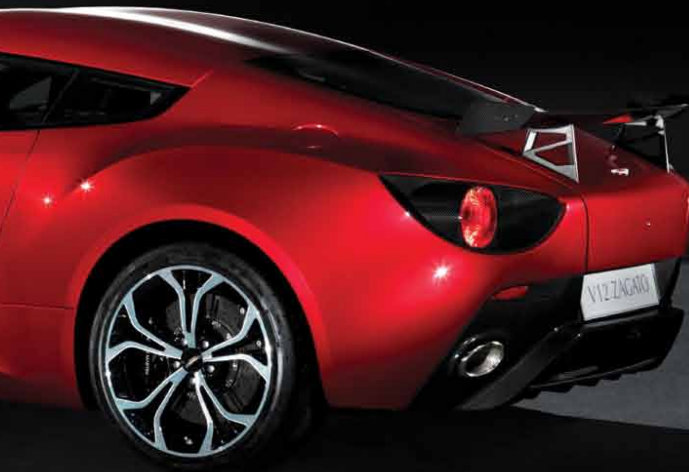
Aston Martin V12 Zagato fitted with wheels manufactured by Rimstock

The Team Dynamics range of alloy wheels are manufactured in the UK in exactly the same way, using the same plant, equipment and personnel so you can be sure that Team Dynamics alloy wheels are manufactured to the highest possible standards.